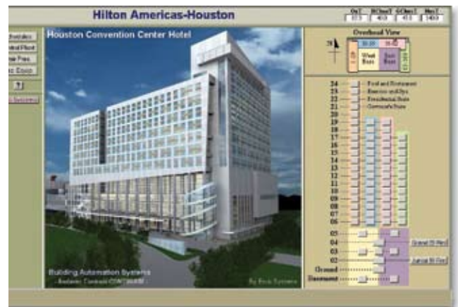
CyberStation workstation home screen